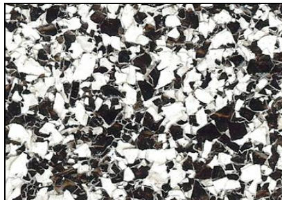
Salt & Pepper