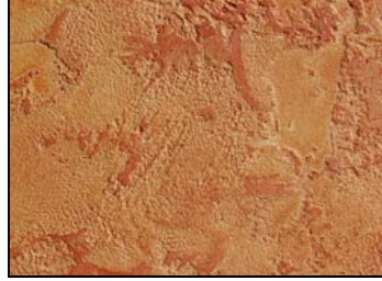
20-65 Sedona Red Standard Color