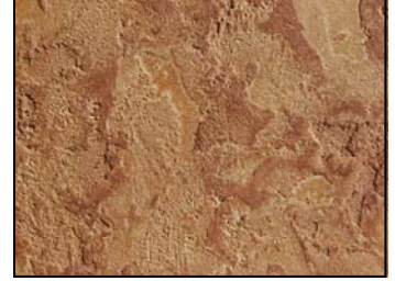
20-67 Sienna Standard Color