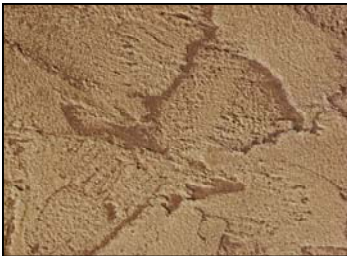
Amber Ale Blend