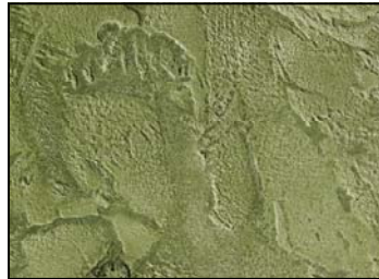
20-68 Green Slate Standard Color