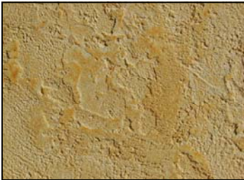
20-63 Sand Stone Standard Color