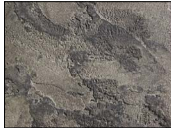
20-71 Black Standard Color