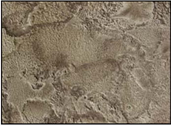
20-62 Gray Slate Standard Color