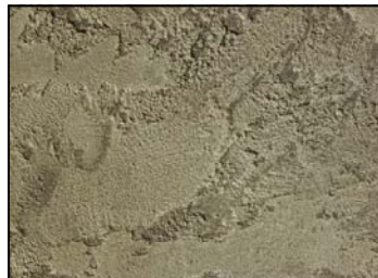
Sage Brush Blend