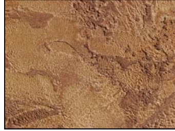
20-64 Umber Standard Color